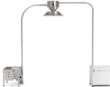
LIFT WITH DESTONER