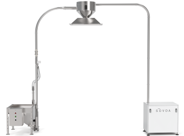
LIFT WITH LANCE + DESTONER